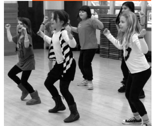
Our YW became a "Zumba® Zone" for several Girl Scout troops, who were empowered by the music, dance moves and motivation of our Zumba Girls program.