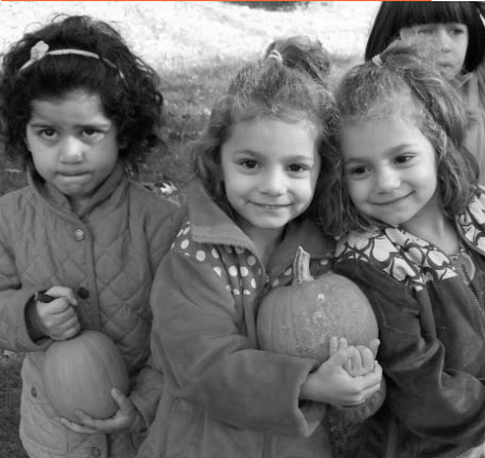
Our Early Childhood programs provided endless opportunities for more than 270 children to learn, grow, and have fun.

Non-Profit Org. U.S. Postage PAID Permit No. 885 Paramus, NJ