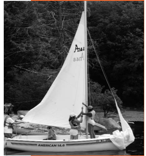
The SEAS sailing certification program at Camp Ma-Kee-Ya was one of several new additions to the YW's summer camp programs, which served over 700 youngsters at four locations throughout Bergen County.