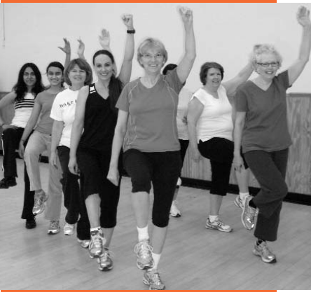
The YW's Walk-Fit classes have become a popular destination for women of all ages and fitness levels—proof that walking really is the best exercise!