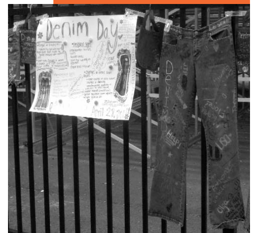
Five area high schools joined the YWCA Rape Crisis Center in raising awareness about consent and healthy relationships during Denim Day 2011. Students and faculty at Lyndhurst HS hung a collection of jeans, embellished with empowerment messages, near the school's main entrance.