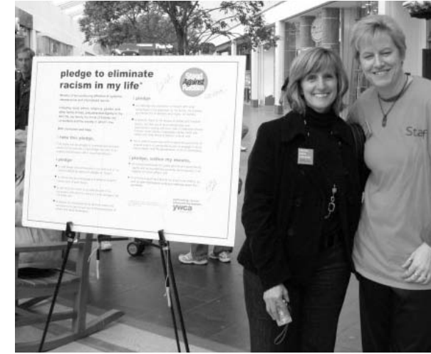
Taking a Stand Against Racism in Paramus Park Mall

For example, we and our YWCA sisters across the country cheered on January 29th, 2009 as President Obama signed his first major piece of legislation: the Lilly Ledbetter Fair Pay Act. The YWCA lent its collective voice to Ms. Ledbetter’s victorious fight to convince Congress to counteract a Supreme Court ruling that required employees to file pay discrimination claims within 180 days of receiving the first discriminatory paycheck. The resulting law enables individuals to challenge ongoing pay discrimination and protects employees from workplace discrimination. On April 3rd, 2009, we built on the work our YW has done to promote increased racial understanding from within our organization and took our mission to the streets, hosting a community-wide Stand Against Racism. A regional YWCA initiative aimed at raising awareness about discrimination and celebrating diversity, the Stand Against Racism was launched in 2008 by the YWCA’s of Trenton and Princeton. This year, our YW was joined by close to 20 businesses and organizations plus local legislators, community activists, students, and area residents for an event that was the first of its kind in Bergen County—and which promises to be the first of many.