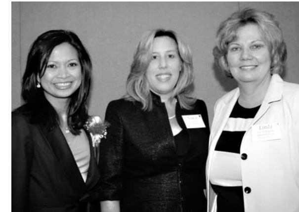
Celebrating 35 years of workplace empowerment at TWIN 2009

As the YWCA Bergen County’s Tribute to Women and Industry (TWIN) awards celebrated its 35th anniversary on April 30th, 2009, it was clear that honoring the accomplishments of professional women—and the staying power of businesses like our sponsors—is as important today as it was when TWIN was established in 1974. The 30 women and 20 companies that received the TWIN Diamond this year are shining examples of the significant role that courage, leadership, and wisdom play in excelling in challenging times. The YWCA was proud to partner with host company, Unilever, which recognizes that creating a diverse work environment that respects, values, and celebrates differences is critical to business success. To them, and to all of our TWIN corporate sponsors, we express our sincere gratitude for their generosity. Our mission lives on through their support.