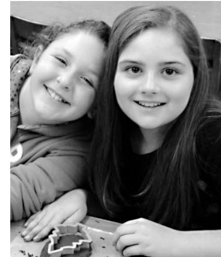
Making friends in a River Vale After School program

This year our YWCA continued its efforts to expand the reach of its child care services and to ensure that they are affordable to Bergen County families. Given the extraordinary economic circumstances, this was no easy task. As demand for financial assistance grew, funding for scholarships decreased. However, we increased the number of sites where we provide before/after school care from 24 to 26. By keeping costs low and providing financial assistance to needy families, our YW helped make summer camp a reality for 13 families (18 children) who could not otherwise have afforded it. And as we prepared to launch our new “Girl Power Camp” (which debuted in July 2009), we were able to offer $4,560 in scholarships so that 11-to-14-year-old girls could enjoy this unique, self-esteem building experience.